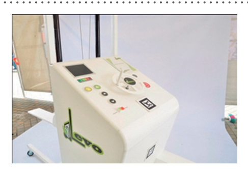
Figure 3. Mock-up set up with augmented reality markers

The pre-work of the validation finish with the construction of the mock-up and the location of the markers on the product. An example of a markers location on mock up can be watched on Figure 3.