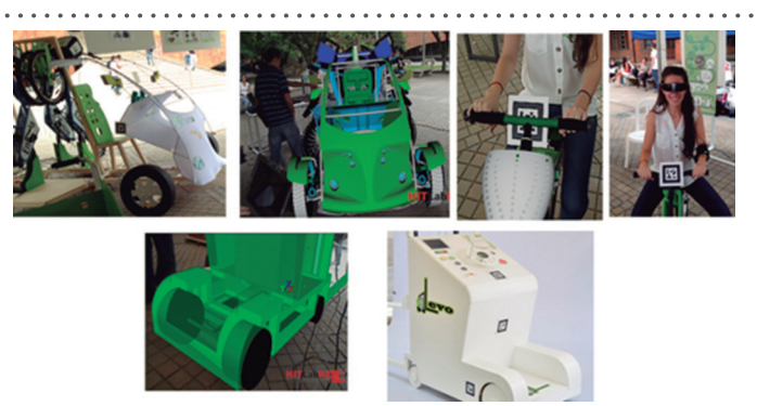
Figure 6. Immersive environments on Project 7 (Photo: Top: Project 72012-1. Bottom: Project 2011-2)

Finally Figure 6 shows how the virtual environment fit the real environment by the use of the VR/AR glasses during the final show case.